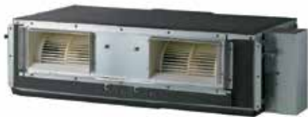
Horizontal Air Handler 24,000 & 36,000 BTU