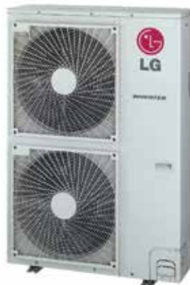
2-8 Zone Outdoor