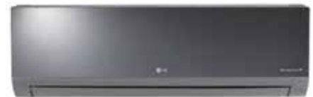
Art Cool™ Mirror