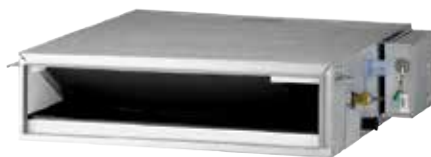
Low-Static Air Handler