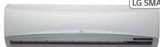
Gloss White 24,000 BTU (30 & 36,000 BTU not Energy Star)