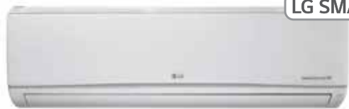
Gloss White 9,000 - 18,000 BTU