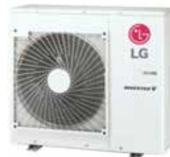
2~4 Zone Outdoor