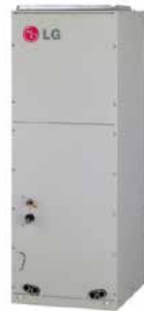
Vertical Air Handler Whole-house solutions

FLEX MULTI OFFERS 2 - 8 SEPARATE INDOOR COMFORT ZONES AND INCLUDES 22 DIFFERENT INDOOR UNITS IN 7 STYLES.