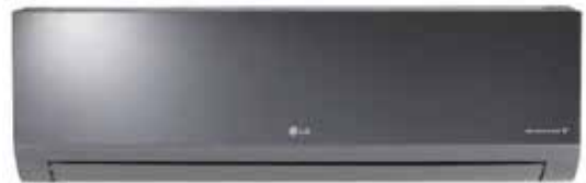
Art Cool™ Mirror 9,000 - 24,000 BTU