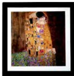
Art Cool™ Gallery