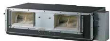
Horizontal Air Handler